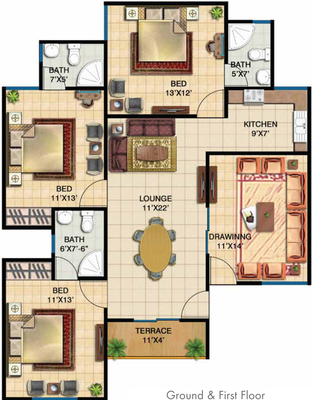
Ground & First Floor Cottage Type A