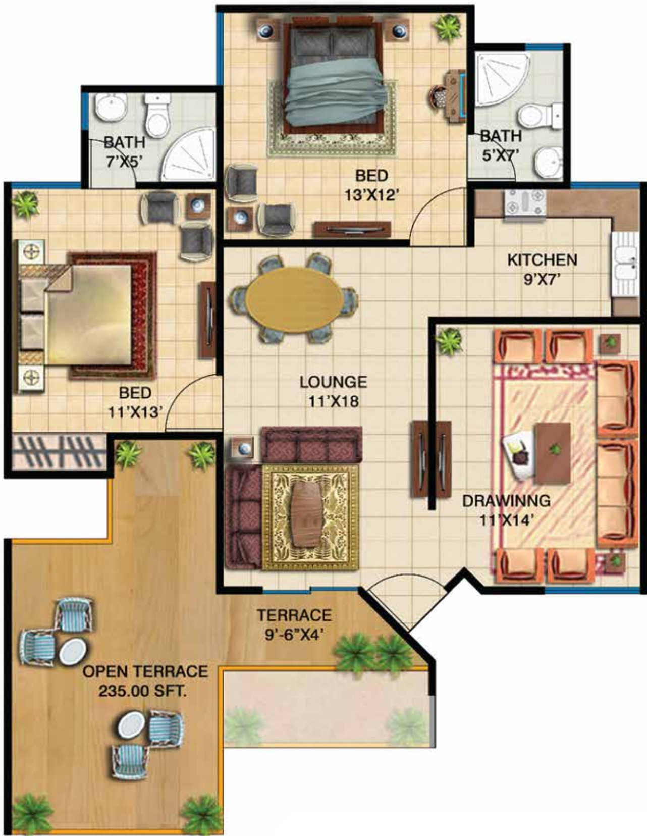
2nd Floor Cottage Type A-1