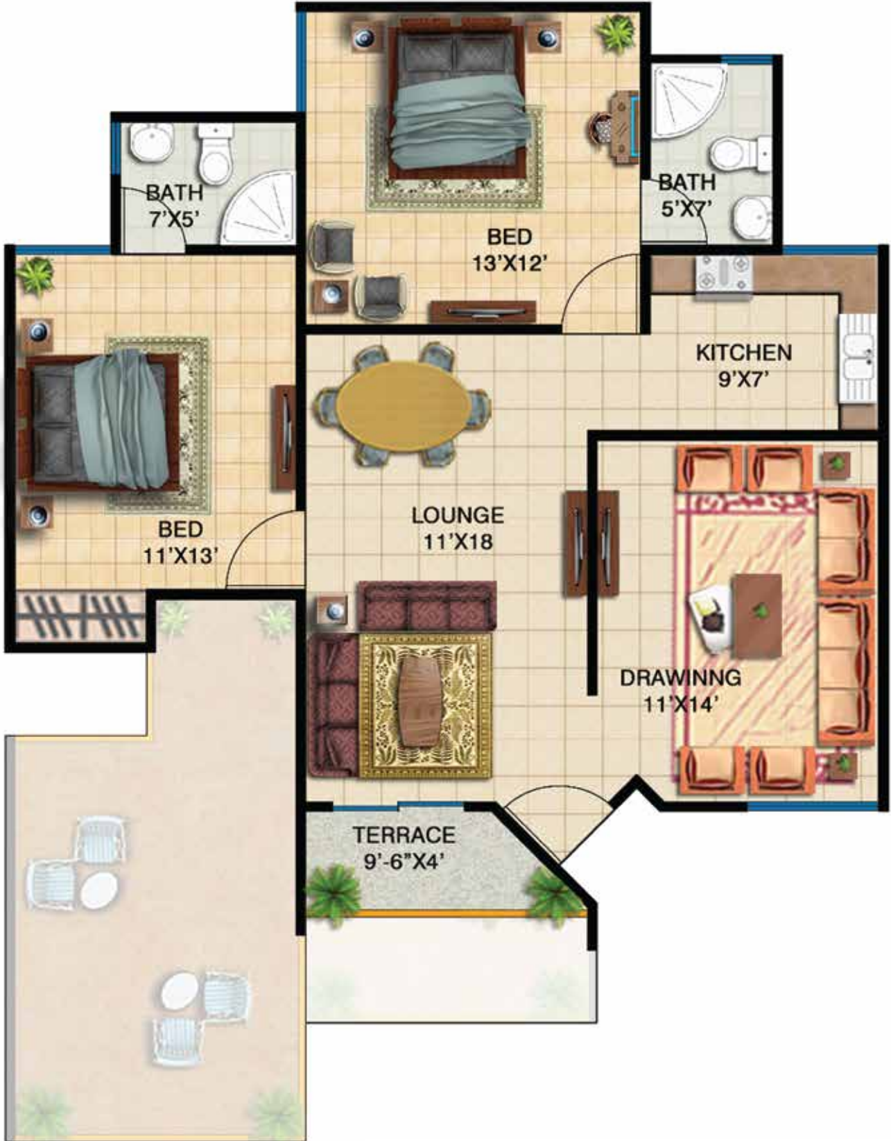
3rd & 4th Floor Cottage Type A-2